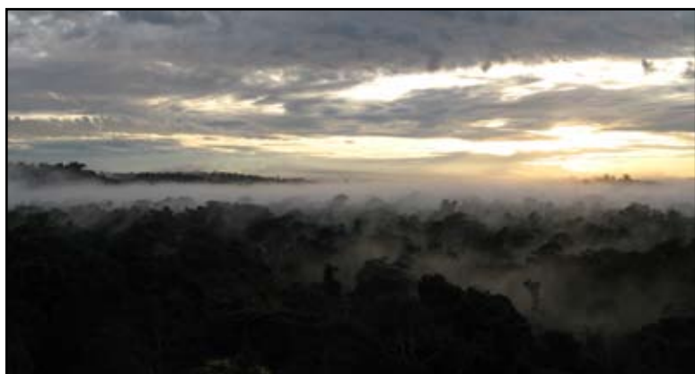
From the canopy tower dawn breaks of the Amazon.

The Cristalino Jungle Lodge has it all: miles of clean, well-marked forest trails through pristine rainforest, abundant bamboo stands, and a 45 meter canopy tower which allows us to experience some rarely seen canopy birds. Afternoon boat trips offer relaxing birding with great opportunities for mammal observations. A natural salt lick and elevated blind near the lodge provides the opportunity to quietly wait for the rare Brazilian tapir or possibly a group of white-lipped or collared peccaries which are attracted to the natural salts. Combine all this with pleasant surroundings and comfortable accommodations and you've got one of the world's top birding destinations.