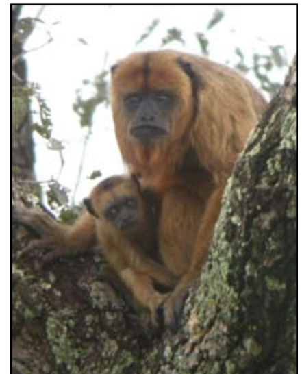
Black howler monkeys Aaron Lang

We'll arrive in time for lunch at the Pousada Pouso Alegre, our home for the night, where the owners are proud to protect a healthy wild population of Hyacinth Macaws. This will allow a unique opportunity to enjoy, study and photograph these magnificent creatures close at hand. This afternoon we may push deeper into the Pantanal to investigate some interesting large grasslands and marshes, or we may decide to enjoy ourselves birding and exploring the area around the lodge.