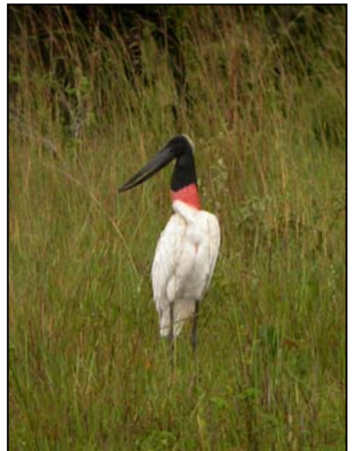
The Pantanal brims with life both large and small. Top: a passion flower blooms along the Transpantaneira. Above: a Jabiru.